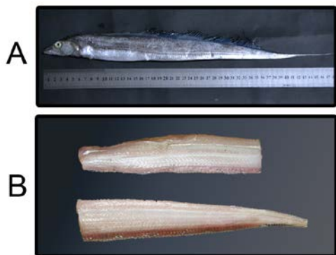
Fig. (1): General appearance of whole fresh (A) and dressed (B) largehead hairtail fish.

The smoking program included three stages drying at 30°C for 30 min, cooking at 50°C for 45 min and intensive hot smoking at 85°C for 50 min. The obtained smoked steaks were cooled at room temperature, packed in low density polyethylene bags, heat sealed under vacuum, quick frozen in an air blast freezer at -30°C and finally stored at -18°C until used.