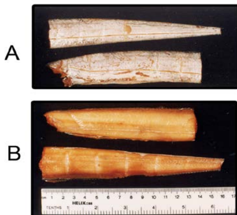
Fig.(2):General appearance of smoked largehead hairtail fish.

Means in a row not sharing the same letter are significantly different at P \leq 0.05